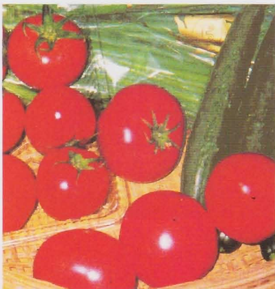
Taste very good by HB-101.