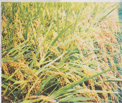
Using HB-101 Do not fall down by hurricane.