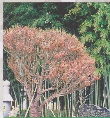
'97.5.20 Start to use-HB-101 HB-101 (5000 times dilution) 5 times use to the soil and leaves