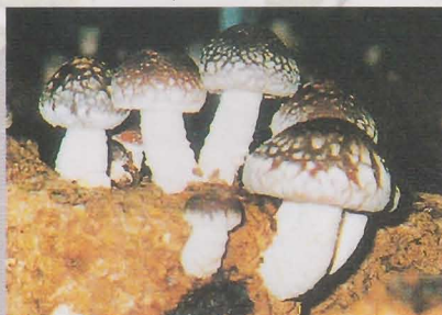
HB-101 makes mushroom taste good.