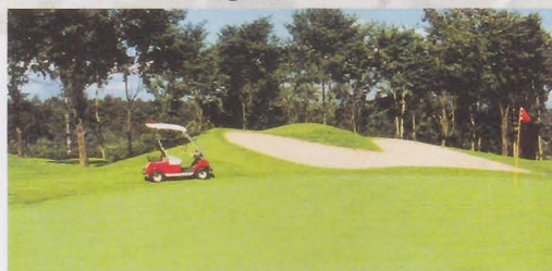
Beautiful green by HB-101.