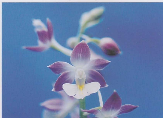
Become very beautiful by HB-101